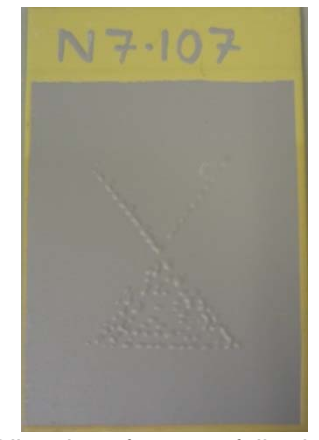
Blistering of topcoat following use of unapproved pen