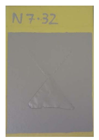
Detachment of topcoat following use of unapproved pen

Marker pens are commonly used to mark up areas of tanks, which require attention during the coating process. The marks made on the underlying coat can cause blistering and detachment of subsequent coats – see photographs of test panels below marked using unapproved marker pens between coats. All marker pens used must be technically approved by the International Paint Worldwide Marine Laboratories prior to use. Information on approved marker pens is available from IP Technical Service Representatives.