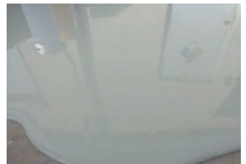
Smooth finish ensuring no secondary surface preparation is required