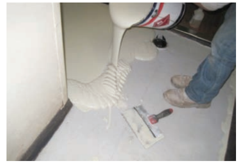
Self-leveling capabilities for easy application and substrate protection