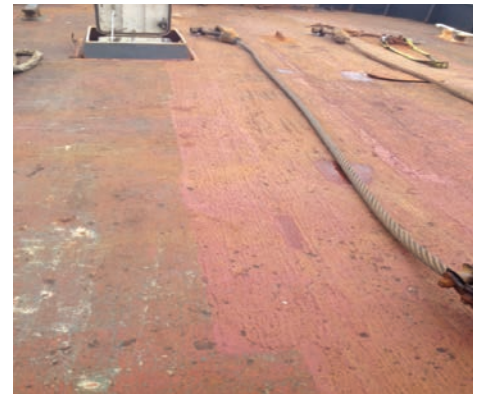
Excellent in-service anti-corrosive performance

To find out more visit: www.international-marine.com