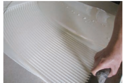
Easy application with trowel