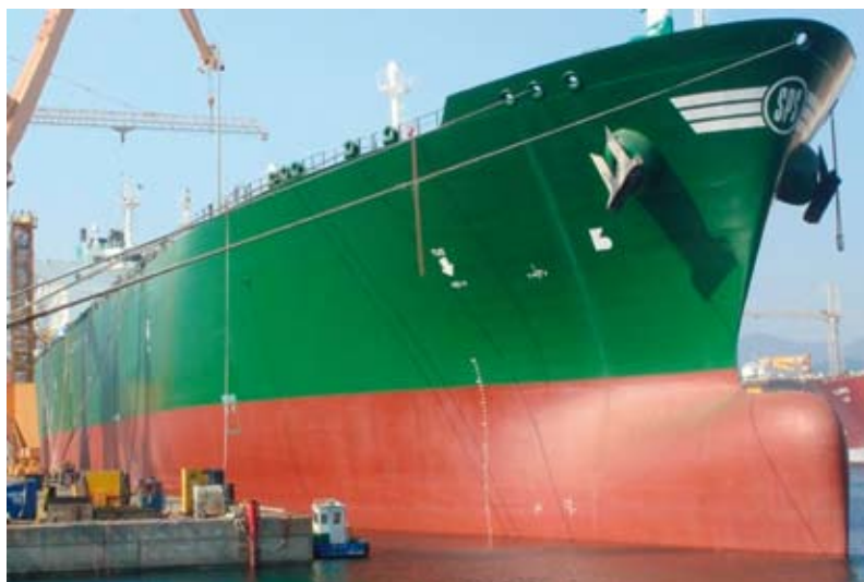
Intersmooth®7465HS SPC: maintaining good antifouling cosmetic appearance during fitting out

New Interswift®6800HS, developed from the proven self polishing Interswift® technology, is a high volume solids, low VOC blend of copper acrylate self polishing copolymer (SPC) technology and rosin based CDP technology. Providing up to 60 months fouling control in service, performance lies between the high performance self polishing copolymer (SPC) antifoulings and the