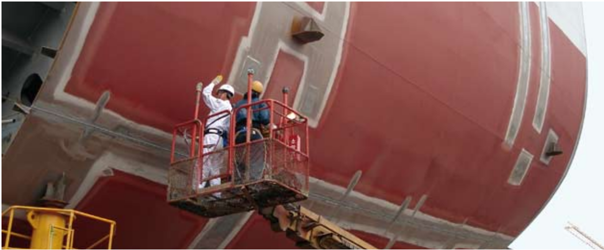
Antifouling coatings – maintaining smooth, clean underwater hulls

A ntifouling coatings make a valuable contribution to the sustained operational efficiency of commercial and naval ships by maintaining smooth, clean underwater hulls.