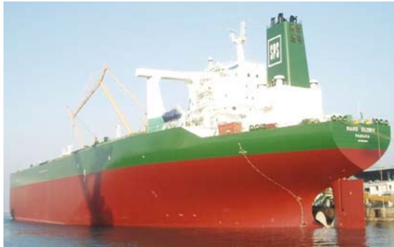
Intersmooth®7460HS SPC application on a 306,000 dwt tanker

brittle material and can cause cracking and detachment; it reacts with oxygen so must be immersed relatively quickly and it does not prevent water entering the antifouling paint film.